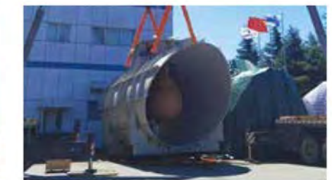
Thrusters China to Finland