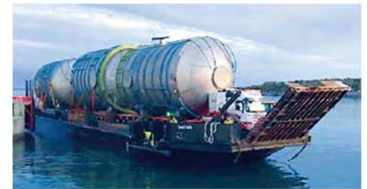
Drum to Sweden