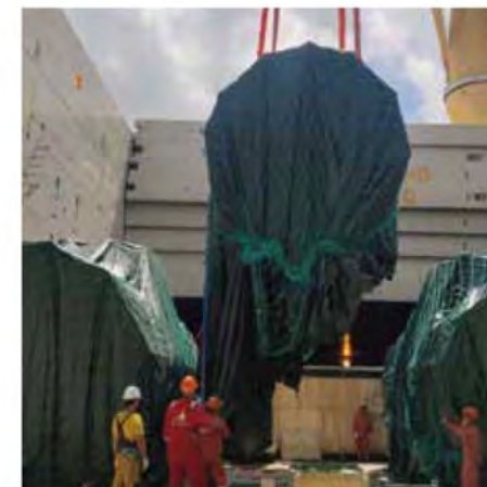
Generator to Finland