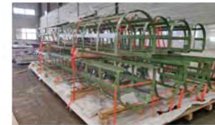
Plywood case packaging