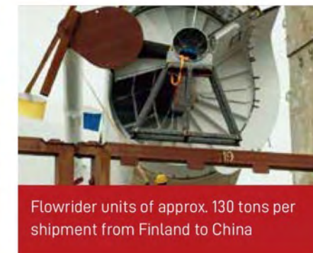
Flowrider units of approx. 130 tons per shipment from Finland to China