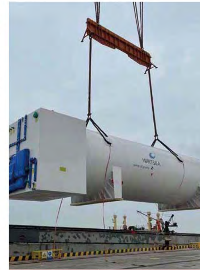
LNG tank China to Turkey