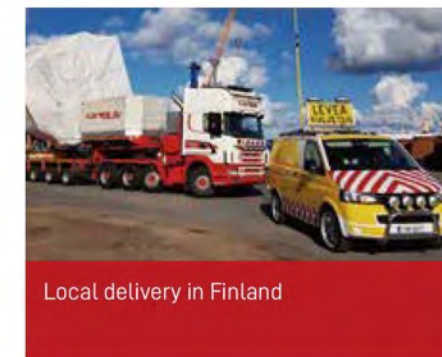
Local delivery in Finland