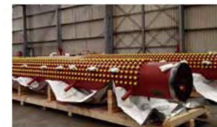
Pallet & Alufoil