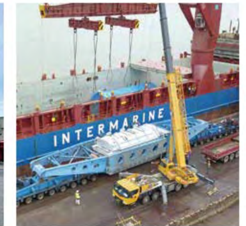
Transformer 400 tons China to Malaysia