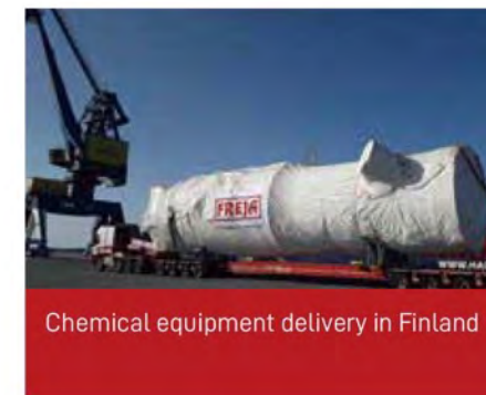
Chemical equipment delivery in Finland