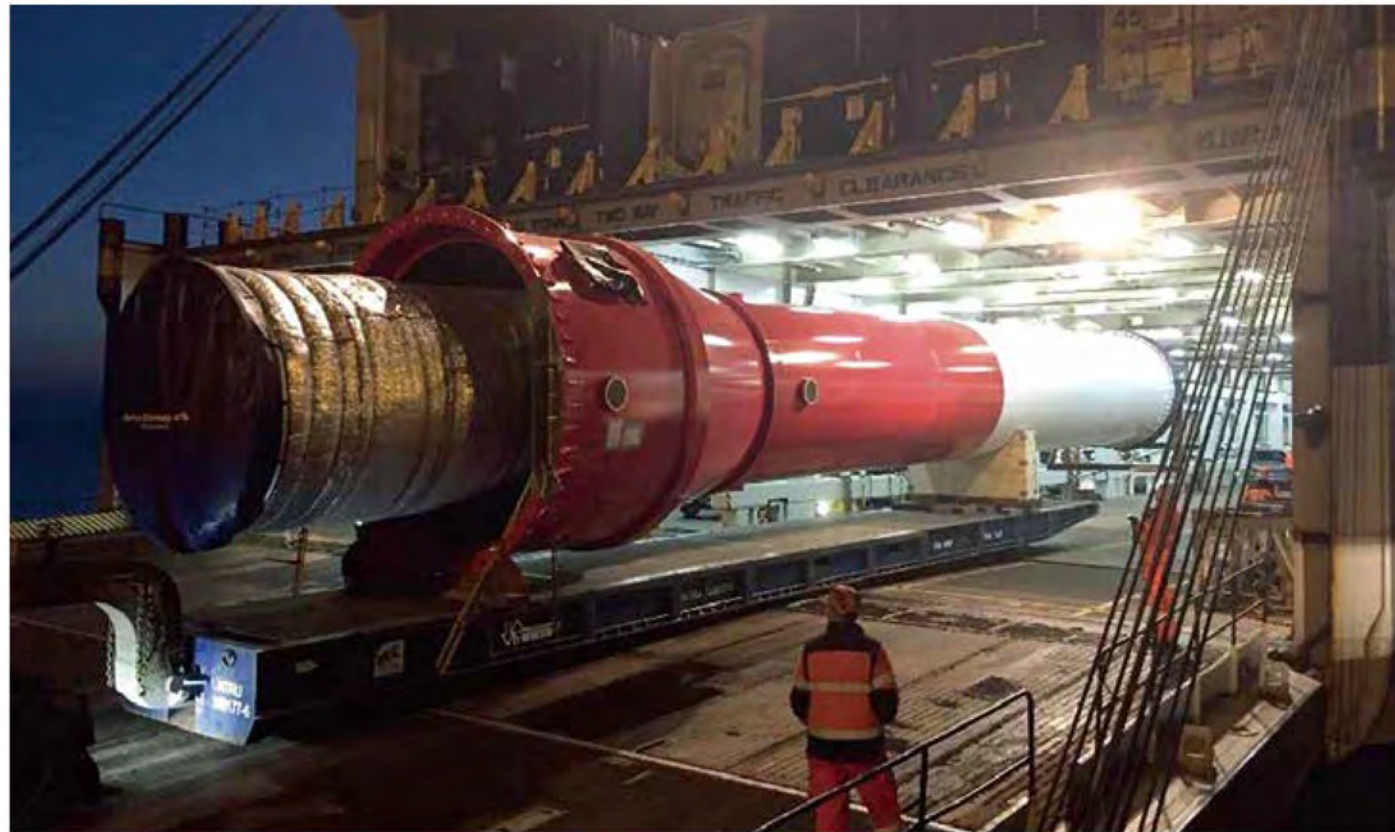
Chimney sections to Thailand