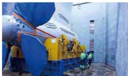
6 Steering and propulsion modules Finland to Far East