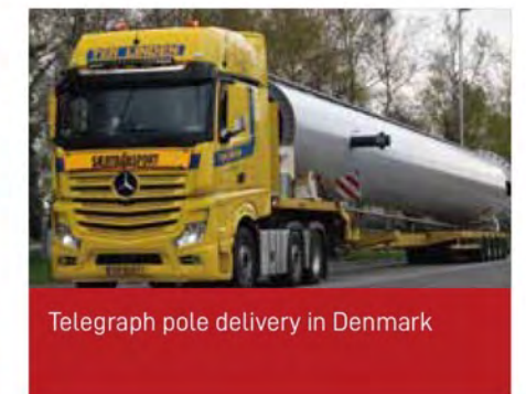
Telegraph pole delivery in Denmark