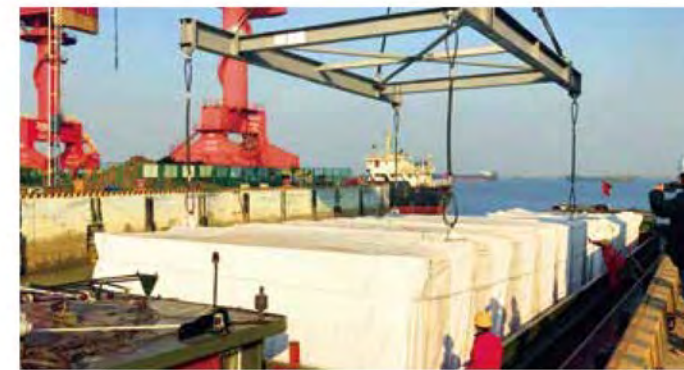
Domesic barge transport in China