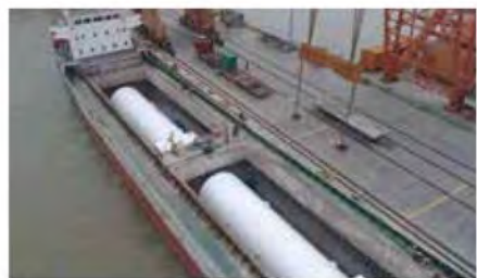
LNG tank to shipyard in China