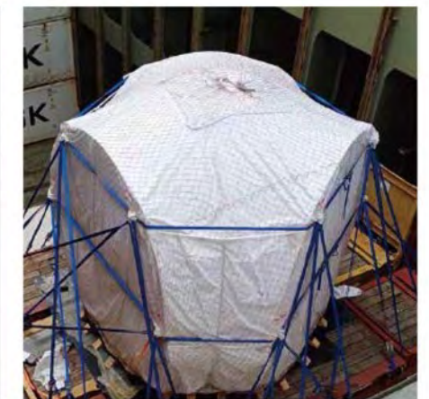
Hub China to Denmark