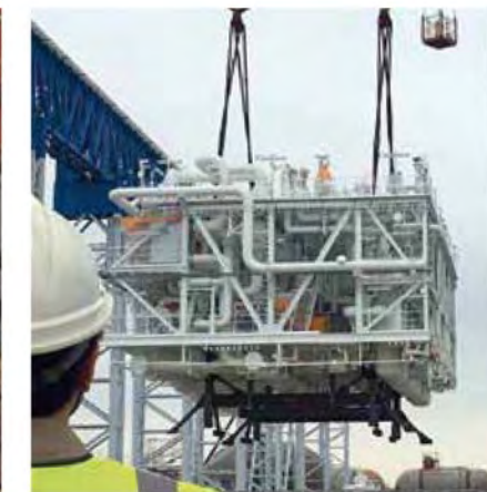
Module China to Korea