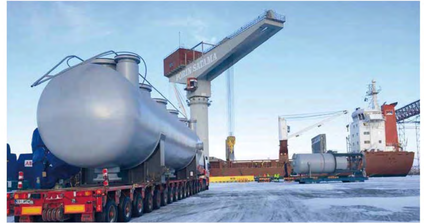
Smelter equipment to Turkey