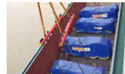
Diesel Engine to Shipyard in China