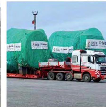
Boiler parts to Finland