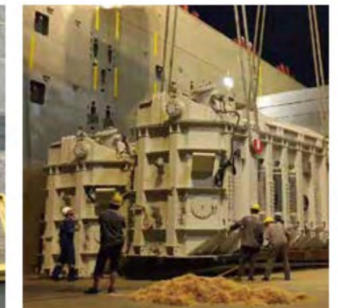
Transformer 260 tons to Columbia