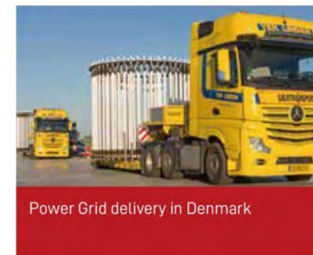
Power Grid delivery in Denmark