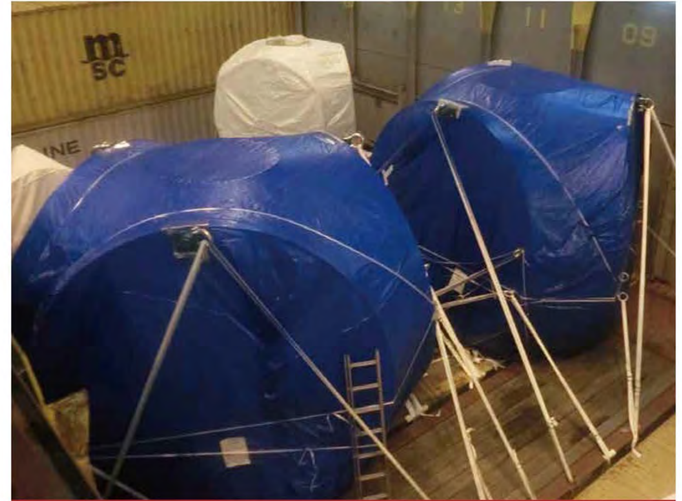
Molds to Germany