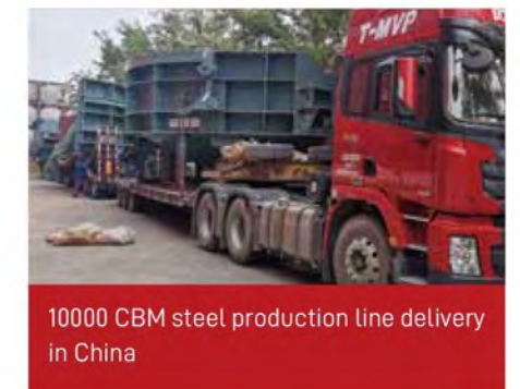
10000 CBM steel production line delivery in China