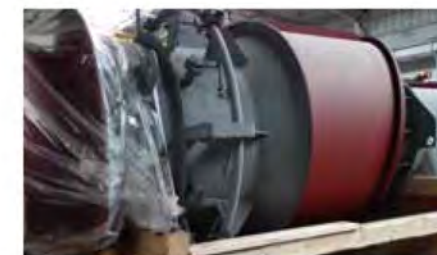
Pallet & PE Foil