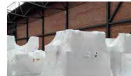
Shrink foil packaging

Complicated cargo does not need to complicate your business. Shipping and logistics needs do not always fit the standards.