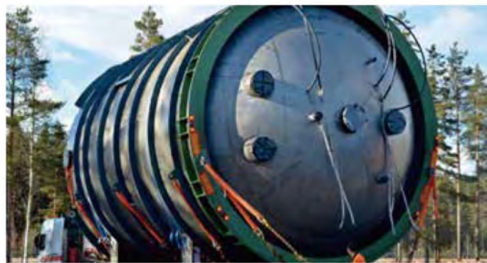
Drum to Sweden