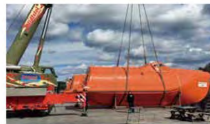
Life boats China to Norway