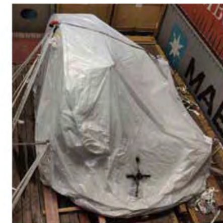
bed frame China to Denmark