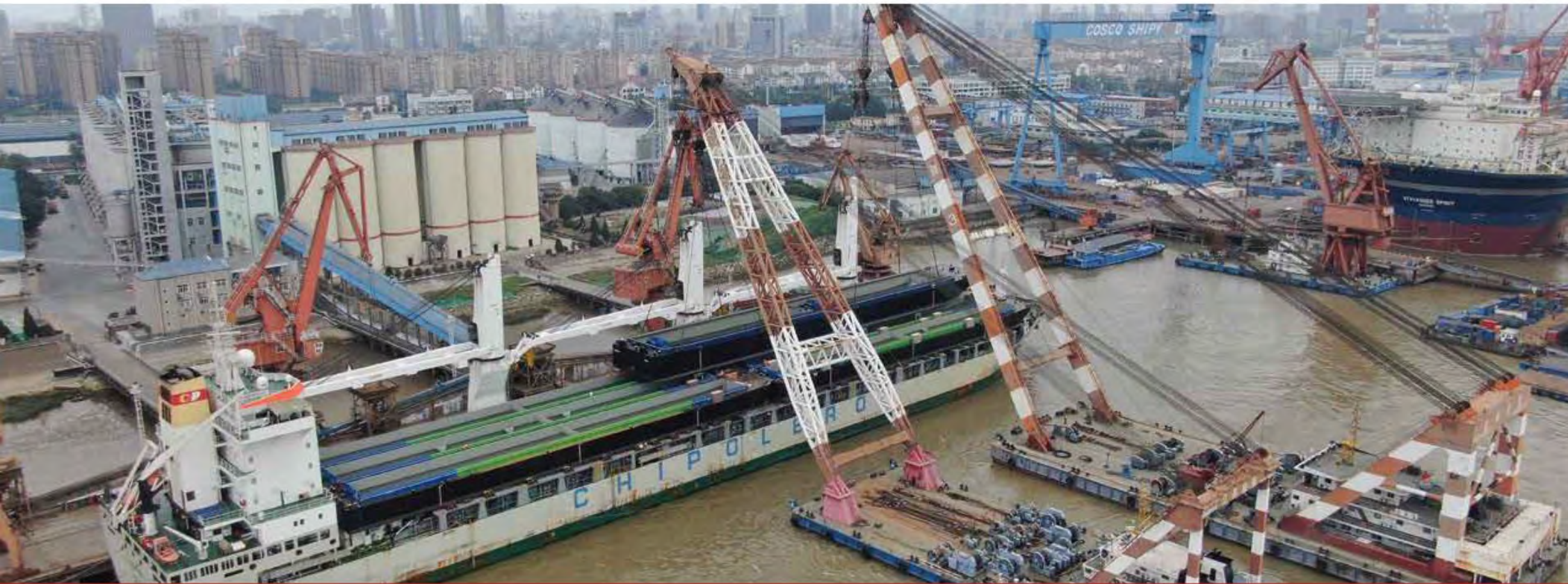
16 barges China to Netherlands