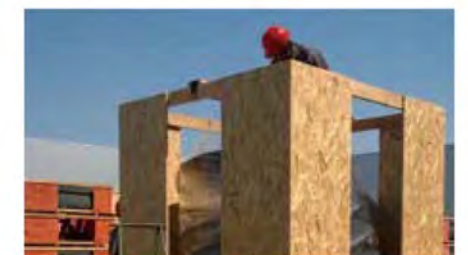
OSB case packaging